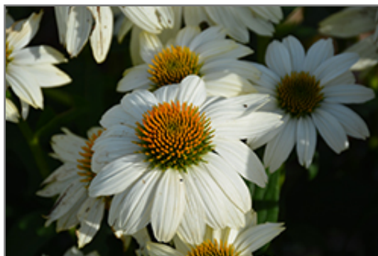
PowWow White Coneflower flowers

PowWow White Coneflower is recommended for the following landscape applications;