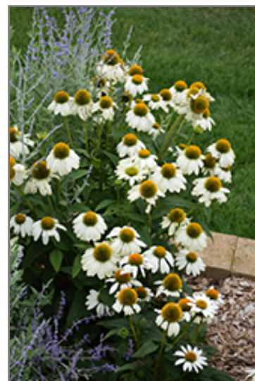
PowWow White Coneflower in bloom