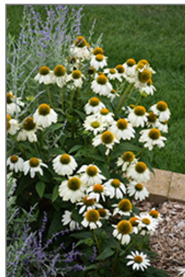
PowWow White Coneflower in bloom