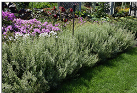
Montrose White Dwarf Calamint in bloom