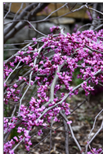
Ruby Falls Redbud flowers