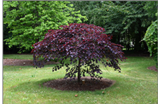
Ruby Falls Redbud

This shrub does best in full sun to partial shade. It prefers to grow in average to moist conditions, and shouldn't be allowed to dry out. It is not particular as to soil type or pH. It is highly tolerant of urban pollution and will even thrive in inner city environments, and will benefit from being planted in a relatively sheltered location. Consider applying a thick mulch around the root zone in winter to protect it in exposed locations or colder microclimates. This is a selection of a native North American species.