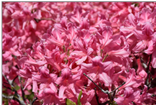
Rosy Lights Azalea flowers