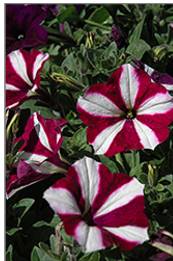
Easy Wave Burgundy Star Petunia flowers

Easy Wave Burgundy Star Petunia is recommended for the following landscape applications;