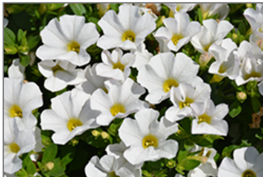
Cabaret White Calibrachoa flowers

Cabaret White Calibrachoa is recommended for the following landscape applications;