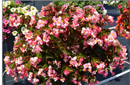
BabyWing Pink Begonia in bloom

BabyWing Pink Begonia is a fine choice for the garden, but it is also a good selection for planting in outdoor containers and hanging baskets. It is often used as a 'filler' in the 'spiller-thriller-filler' container combination, providing a mass of flowers and foliage against which the thriller plants stand out. Note that when growing plants in outdoor containers and baskets, they may require more frequent waterings than they would in the yard or garden.