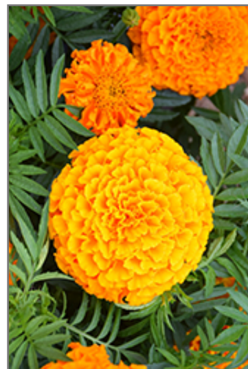
Taishan Orange Marigold flowers