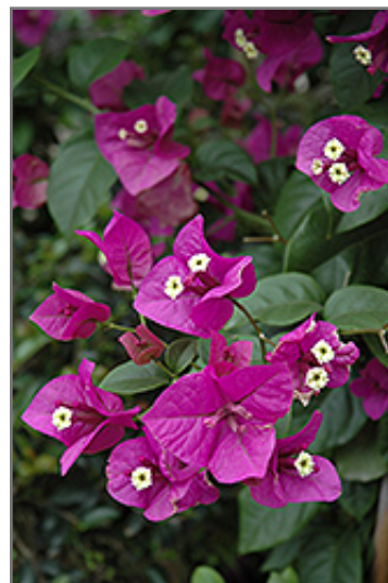
Purple Queen Bougainvillea flowers