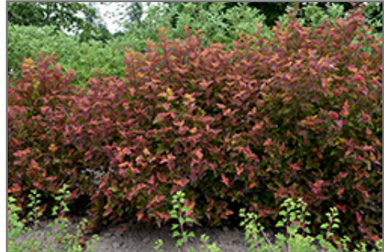
Amber Jubilee Ninebark

This shrub does best in full sun to partial shade. It is very adaptable to both dry and moist locations, and should do just fine under average home landscape conditions. It is not particular as to soil type or pH. It is highly tolerant of urban pollution and will even thrive in inner city environments. This is a selection of a native North American species.