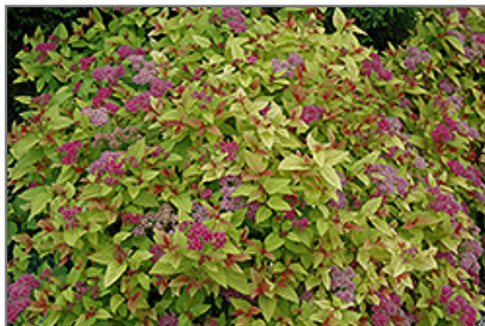
Magic Carpet Spirea flowers