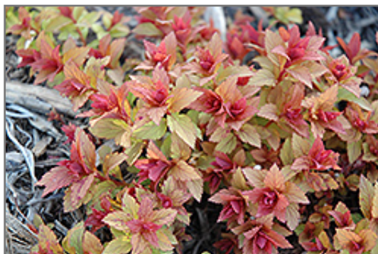
Magic Carpet Spirea foliage