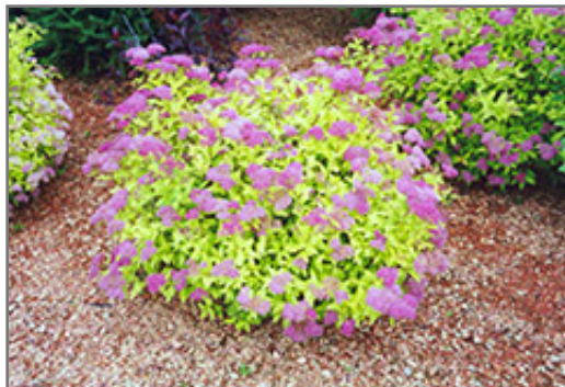
Goldmound Spirea in bloom

This shrub should only be grown in full sunlight. It prefers to grow in average to moist conditions, and shouldn't be allowed to dry out. It is not particular as to soil type or pH. It is highly tolerant of urban pollution and will even thrive in inner city environments. This is a selected variety of a species not originally from North America.