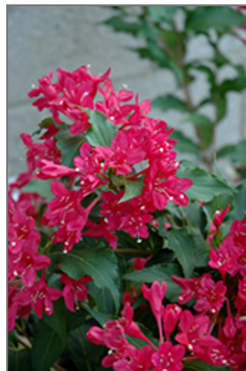
Sonic Bloom Red Reblooming Weigela flowers