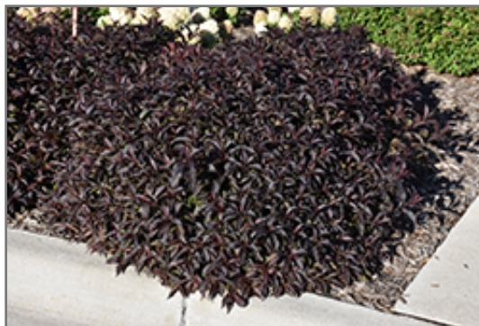
Spilled Wine Weigela