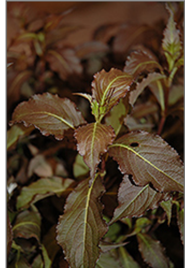
Spilled Wine Weigela foliage

Spilled Wine Weigela makes a fine choice for the outdoor landscape, but it is also well-suited for use in outdoor pots and containers. Because of its height, it is often used as a 'thriller' in the 'spiller-thriller-filler' container combination; plant it near the center of the pot, surrounded by smaller plants and those that spill over the edges. It is even sizeable enough that it can be grown alone in a suitable container. Note that when grown in a container, it may not perform exactly as indicated on the tag - this is to be expected. Also note that when growing plants in outdoor containers and baskets, they may require more frequent waterings than they would in the yard or garden.