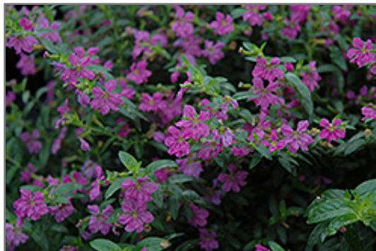
Allyson Mexican Heather flowers