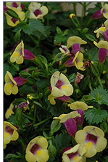
Yellow Moon Torenia flowers

Yellow Moon Torenia is recommended for the following landscape applications;