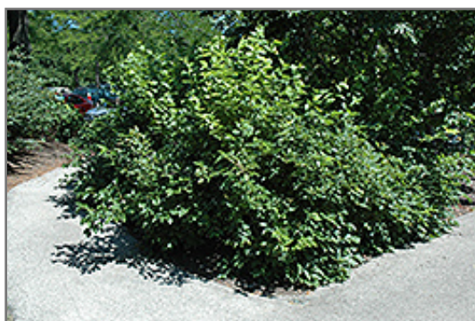
Chicago Lustre Viburnum