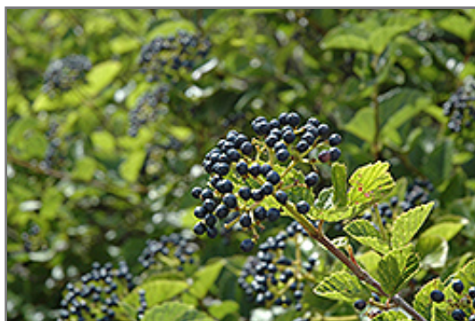
Chicago Lustre Viburnum fruit