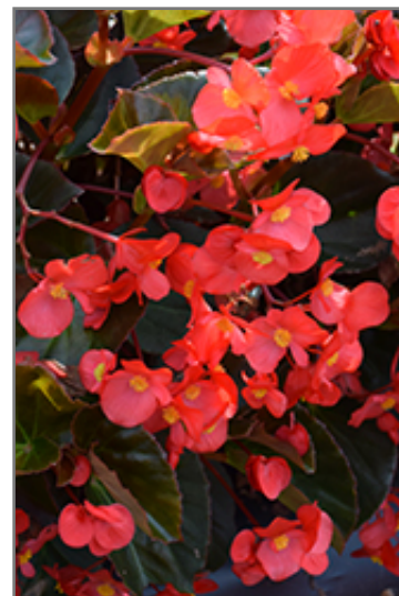
Big Red Bronze Leaf Begonia flowers

Big Red Bronze Leaf Begonia is a fine choice for the garden, but it is also a good selection for planting in outdoor containers and hanging baskets. It is often used as a 'filler' in the 'spiller-thriller-filler' container combination, providing a mass of flowers and foliage against which the larger thriller plants stand out. Note that when growing plants in outdoor containers and baskets, they may require more frequent waterings than they would in the yard or garden.