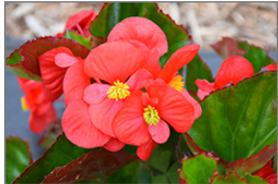
Big Red Green Leaf Begonia flowers

Big Red Green Leaf Begonia is recommended for the following landscape applications;