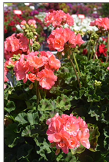
Dynamo Salmon Geranium flowers