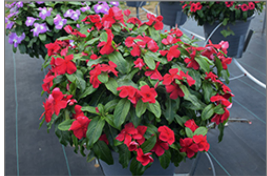
Titan Dark Red Vinca in bloom

Titan Dark Red Vinca will grow to be about 14 inches tall at maturity, with a spread of 12 inches. Its foliage tends to remain dense right to the ground, not requiring facer plants in front. Although it's not a true annual, this fast-growing plant can be expected to behave as an annual in our climate if left outdoors over the winter, usually needing replacement the following year. As such, gardeners should take into consideration that it will perform differently than it would in its native habitat.