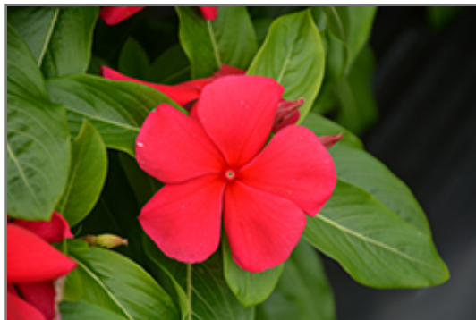
Titan Dark Red Vinca flowers

Titan Dark Red Vinca is recommended for the following landscape applications;