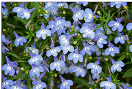
Techno Upright Light Blue Lobelia flowers

Techno Upright Light Blue Lobelia is recommended for the following landscape applications;