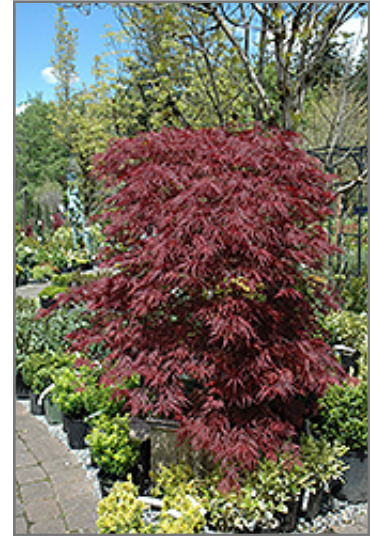
Red Dragon Japanese Maple

Red Dragon Japanese Maple is a fine choice for the yard, but it is also a good selection for planting in outdoor pots and containers. Because of its height, it is often used as a 'thriller' in the 'spiller-thriller-filler' container combination; plant it near the center of the pot, surrounded by smaller plants and those that spill over the edges. It is even sizeable enough that it can be grown alone in a suitable container. Note that when grown in a container, it may not perform exactly as indicated on the tag - this is to be expected. Also note that when growing plants in outdoor containers and baskets, they may require more frequent waterings than they would in the yard or garden.