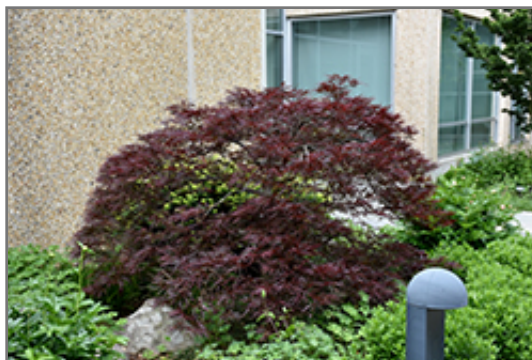
Red Dragon Japanese Maple

Red Dragon Japanese Maple is recommended for the following landscape applications;