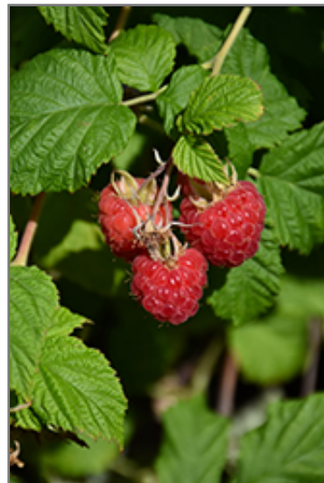
Raspberry Shortcake Raspberry fruit

This is an open multi-stemmed deciduous shrub with an upright spreading habit of growth. Its relatively coarse texture can be used to stand it apart from other landscape plants with finer foliage. This is a high maintenance plant that will require regular care and upkeep. Each spring, cut back all dead and two-year old canes to the ground, leaving only last year's growth standing. It is a good choice for attracting birds to your yard. Gardeners should be aware of the following characteristic(s) that may warrant special consideration;