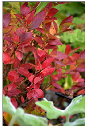
Jelly Bean Blueberry in fall

Jelly Bean Blueberry features dainty clusters of white bell-shaped flowers with shell pink overtones hanging below the branches in mid spring. It has red-variegated green foliage. The glossy oval leaves turn an outstanding red in the fall. It features an abundance of magnificent blue berries in mid summer.