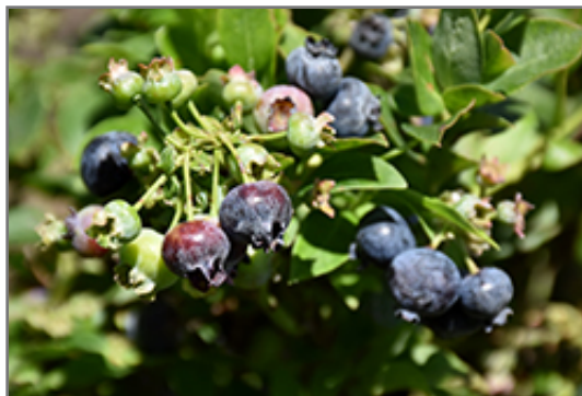
Jelly Bean Blueberry fruit