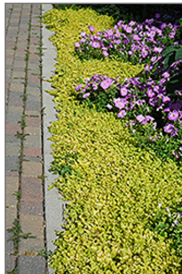
Golden Creeping Jenny