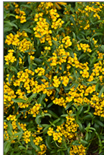
Mexican Tarragon flowers

Mexican Tarragon will grow to be about 30 inches tall at maturity, with a spread of 18 inches. Its foliage tends to remain dense right to the ground, not requiring facer plants in front. Although it's not a true annual, this plant can be expected to behave as an annual in our climate if left outdoors over the winter, usually needing replacement the following year. As such, gardeners should take into consideration that it will perform differently than it would in its native habitat.