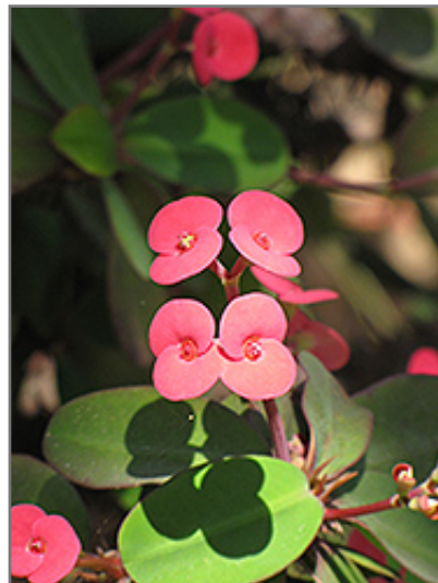
Crown Of Thorns flowers