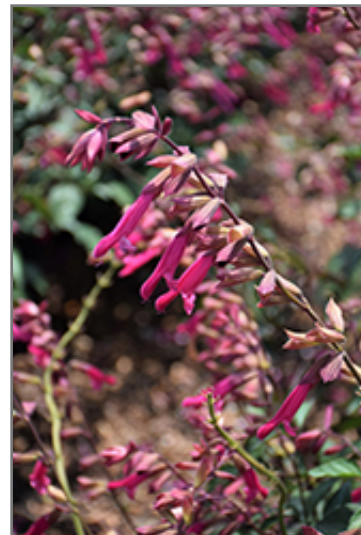
Wendy's Wish Sage flowers