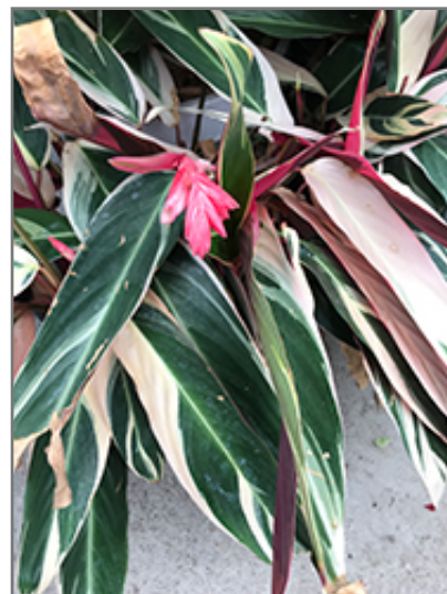
Tricolor Stromanthe flowers

This plant does best in full sun to partial shade. It prefers to grow in average to moist conditions, and shouldn't be allowed to dry out. It is not particular as to soil pH, but grows best in rich soils. It is somewhat tolerant of urban pollution. This is a selected variety of a species not originally from North America. It can be propagated by division; however, as a cultivated variety, be aware that it may be subject to certain restrictions or prohibitions on propagation.