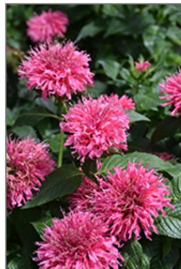
Bubblegum Blast Beebalm flowers

Bubblegum Blast Beebalm is recommended for the following landscape applications;