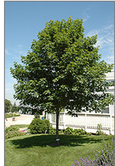
Fall Fiesta Sugar Maple

This tree should only be grown in full sunlight. It prefers to grow in average to moist conditions, and shouldn't be allowed to dry out. It is not particular as to soil pH, but grows best in rich soils. It is somewhat tolerant of urban pollution. This is a selection of a native North American species.