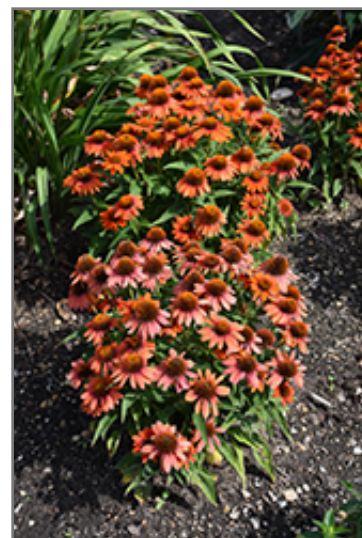
Sombrero Adobe Orange Coneflower in bloom