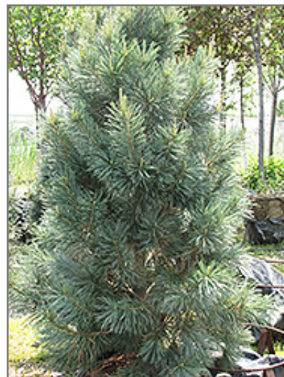
Vanderwolf's Pyramid Pine