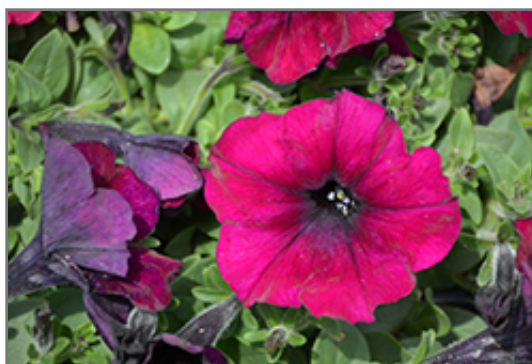
Easy Wave Burgundy Velour Petunia flowers