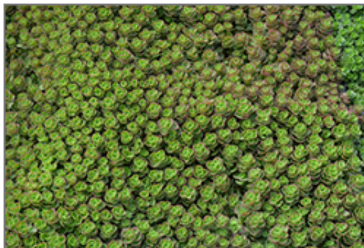
Dragon's Blood Stonecrop foliage