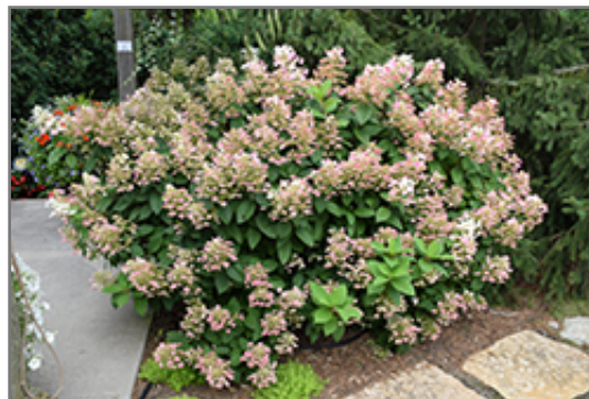
Little Quick Fire Hydrangea in bloom