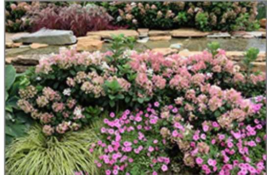
Little Quick Fire Hydrangea in bloom

Little Quick Fire Hydrangea makes a fine choice for the outdoor landscape, but it is also well-suited for use in outdoor pots and containers. With its upright habit of growth, it is best suited for use as a 'thriller' in the 'spiller-thriller-filler' container combination; plant it near the center of the pot, surrounded by smaller plants and those that spill over the edges. It is even sizeable enough that it can be grown alone in a suitable container. Note that when grown in a container, it may not perform exactly as indicated on the tag - this is to be expected. Also note that when growing plants in outdoor containers and baskets, they may require more frequent waterings than they would in the yard or garden.