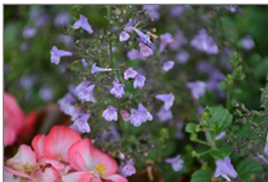
Marvelette Blue Dwarf Calamint flowers