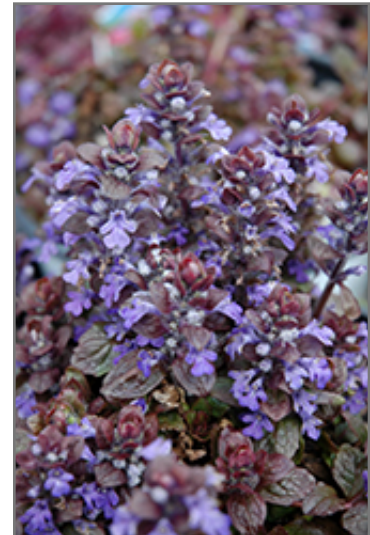
Bronze Beauty Bugleweed flowers

Bronze Beauty Bugleweed is recommended for the following landscape applications;