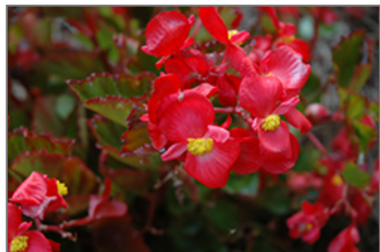
BabyWing Red Begonia flowers