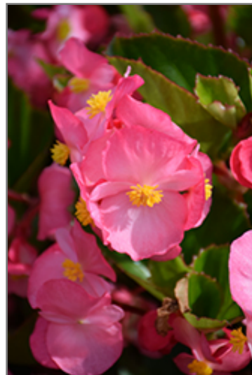
Big Pink Green Leaf Begonia flowers