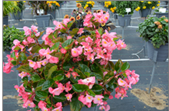
Big Pink Green Leaf Begonia in bloom

Big Pink Green Leaf Begonia is a fine choice for the garden, but it is also a good selection for planting in outdoor containers and hanging baskets. It is often used as a 'filler' in the 'spiller-thriller-filler' container combination, providing a mass of flowers and foliage against which the larger thriller plants stand out. Note that when growing plants in outdoor containers and baskets, they may require more frequent waterings than they would in the yard or garden.