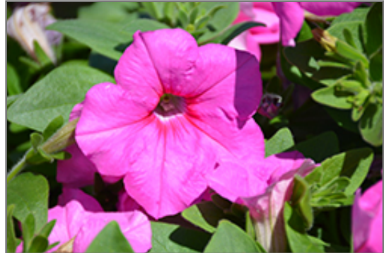
Easy Wave Pink Passion Petunia flowers

Easy Wave Pink Passion Petunia is recommended for the following landscape applications;