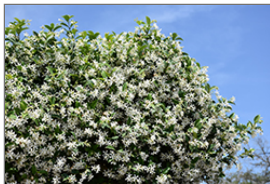
Madison Star-Jasmine flowers