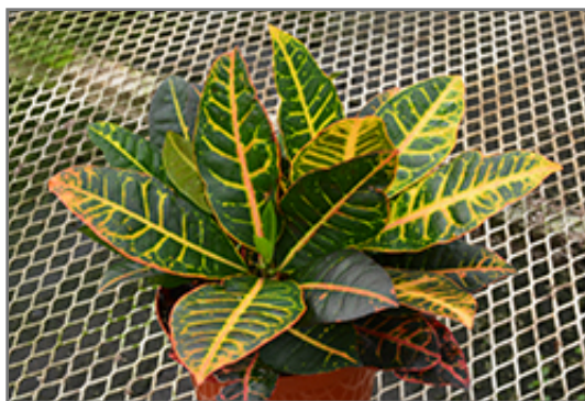
Petra Variegated Croton in full