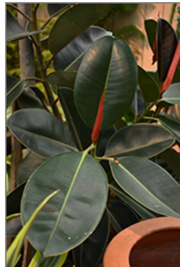
Rubber Tree foliage

When grown indoors, Rubber Tree can be expected to grow to be about 7 feet tall at maturity, with a spread of 5 feet. It grows at a medium rate, and under ideal conditions can be expected to live for approximately 50 years. This houseplant performs well in both bright or indirect sunlight and strong artificial light, and can therefore be situated in almost any well-lit room or location. It prefers dry to average moisture levels with very well-drained soil, and may die if left in standing water for any length of time. This plant should be watered when the surface of the soil gets dry, and will need watering approximately once each week. Be aware that your particular watering schedule may vary depending on its location in the room, the pot size, plant size and other conditions; if in doubt, ask one of our experts in the store for advice. It is not particular as to soil type or pH; an average potting soil should work just fine.