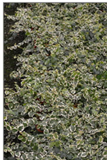
Variegated Creeping Fig in full