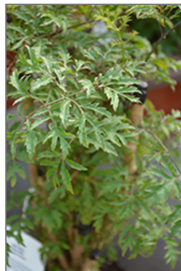
Ming Aralia foliage