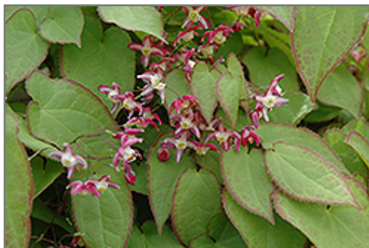
Bishop's Hat flowers