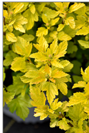
Tiny Wine Gold Ninebark foliage