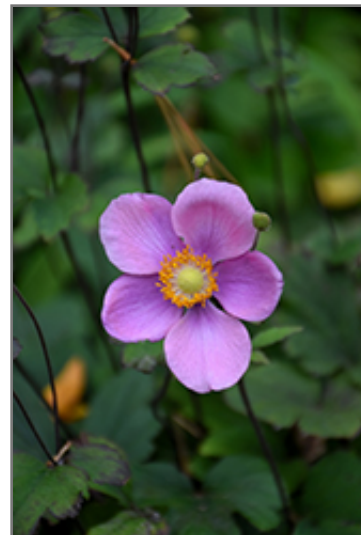
Lucky Charm Anemone flowers